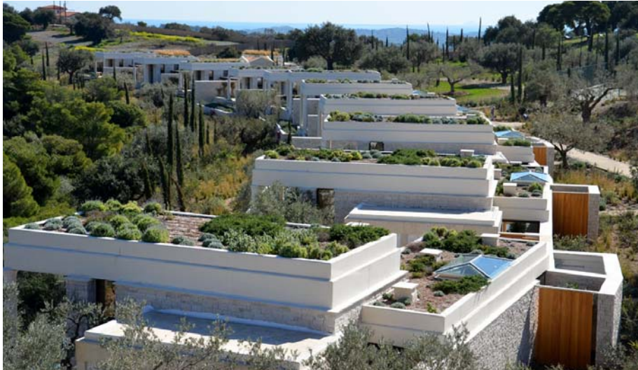
The green covered pavilions of the Amanzoe hotel complex harmoniously blend into the surroundings.