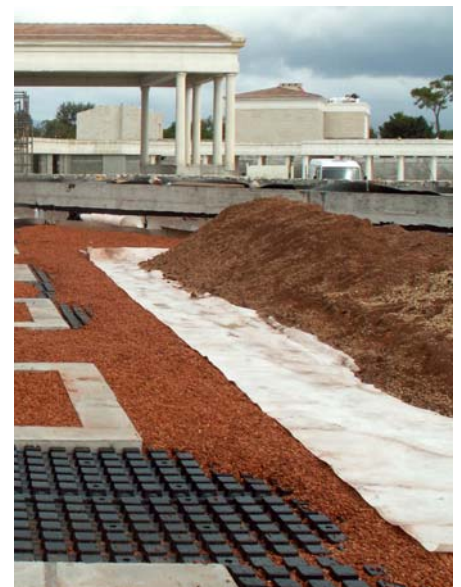
Floradrain® FD 60 elements were applied and infilled with Zincolit® Plus on this entire roof surface, also in the plant troughs which were meant for olive trees.