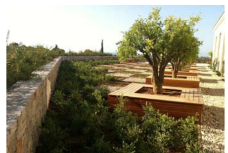
The room for root development of the olive trees was extended by special planting troughs.