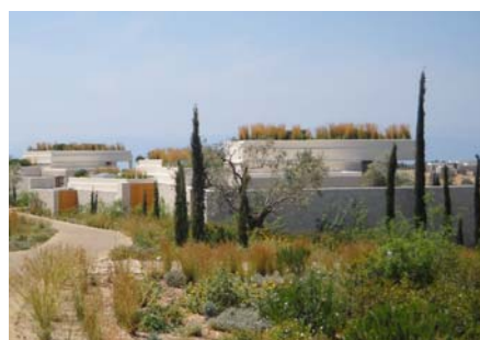
... but also with grasses which are typical for this region and can cope with the heat very well.